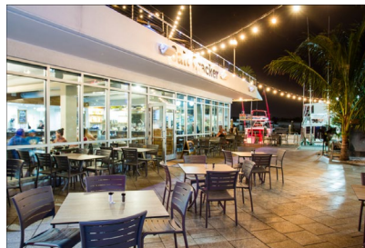
These are examples of outdoor seating allowed with social distancing.