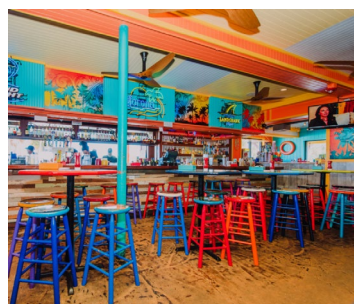
Allowed at tabletops